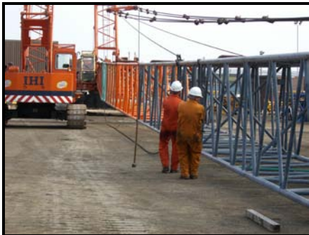
Fig. 3 – Extending Rope At Ground Level