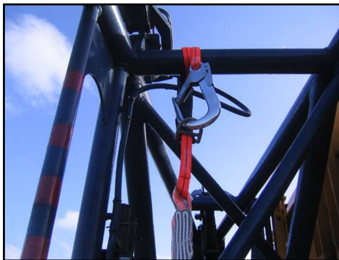
Figure 4 - Lanyard Shortening Device

Further information on “fall factors” is given in Clause 9.1.3.1 of BS 8437:2005 - Code of practice for selection, use and maintenance of personal fall protection systems and equipment for use in the workplace .