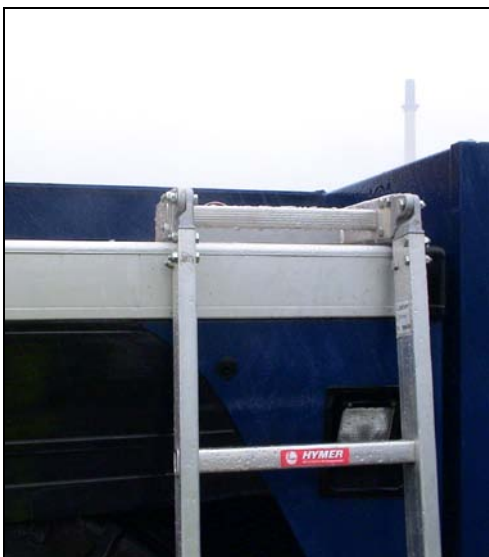
Fig. 3 - Original Ladder Swung Round From Stowage Position