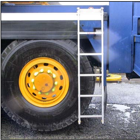
Fig. 1 - Original Freely Suspended Access Ladder