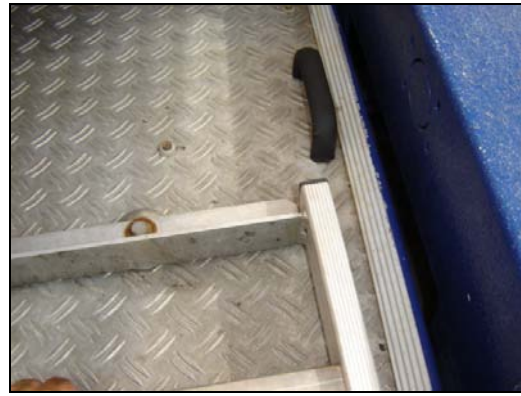
Fig. 8 - New Grab Handle