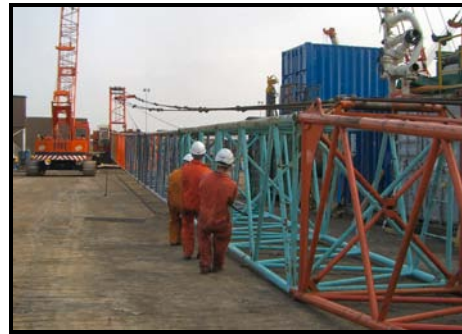
Fig. 4 – Bigger Team For Longer Ropes