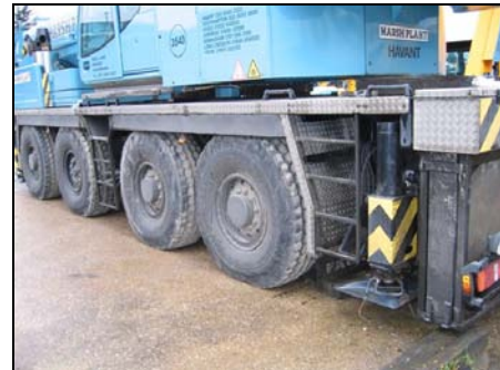
Fig. 2 - Additional Access Ladders