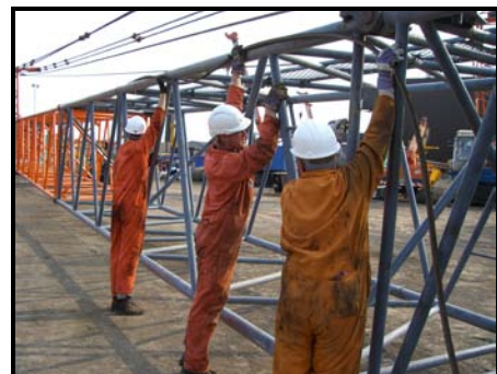
Fig. 6 – Lifting Rope Onto Jib