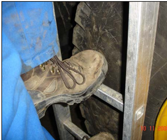
Fig. 2 - Insufficient Foot Penetration