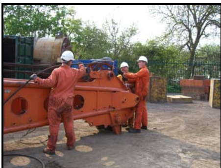
Fig. 5 – Rope Through Head Sheaves