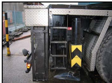
Fig. 4 - Decal Location