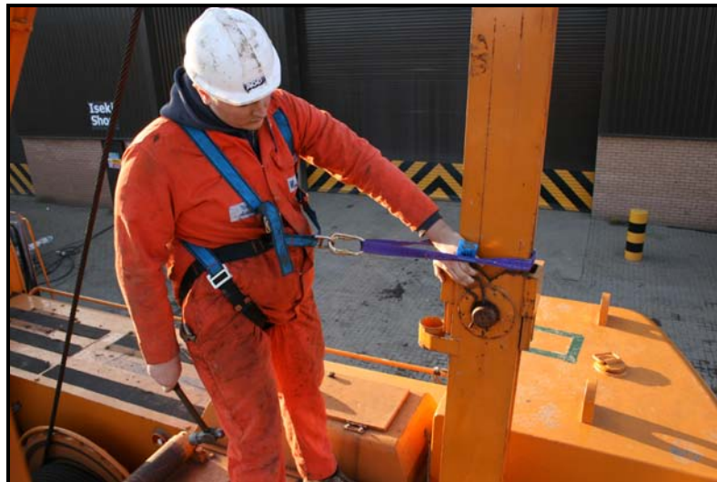
Figure 1 - Work Restraint System

Work restraint systems are designed to prevent personnel from reaching an unprotected edge and falling. By definition they restrain the wearer by restricting movement and may be of limited value when working on the crane structure.